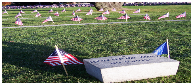
NH graves at Soldiers' Cemetery in Gettysburg

The Civil War Roundtable of New Hampshire welcomes anyone with an interest in the American Civil War who would like to be with others who share the same desire to learn more of this time in American history. We are an informal club with the